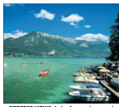
PERFECT VIEWS: Lake Annecy is a must

Priding themselves on their excellent customer service,